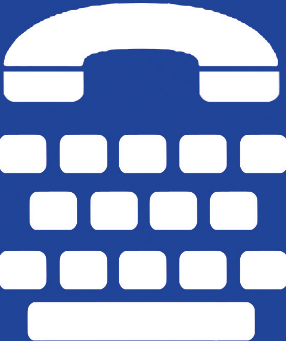
Telephone Typewriter (TTY)