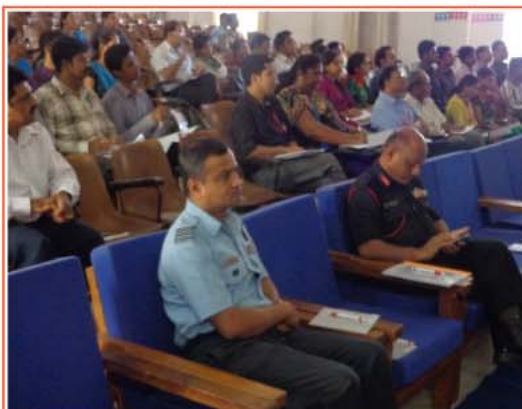
Online Bill Training by UTI-ITSL to Hospital Reps