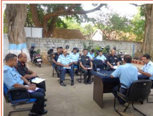
Sainik Samelan Apr 14