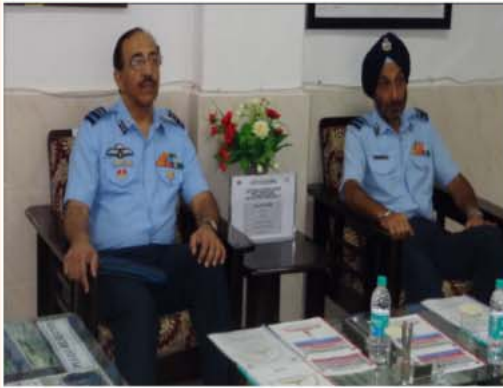
Visit of Air Mshl PS Bhel DGMS (Air)