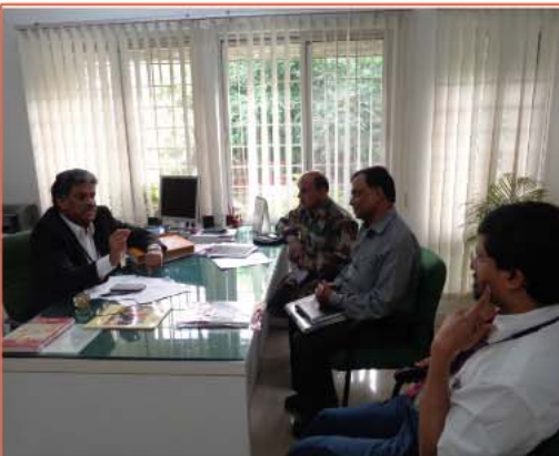
Jt Dir accom- panied by OIC PC Yelahanka visits Hospital