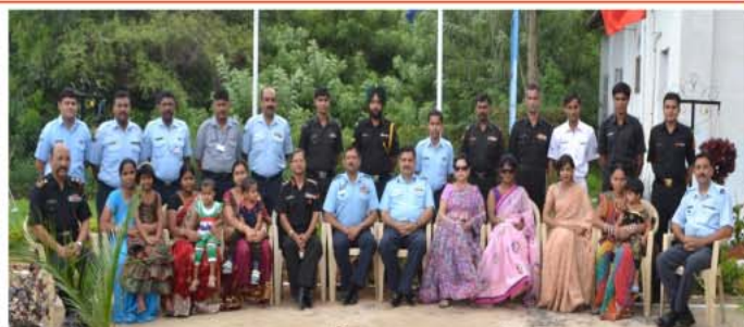
Regional Centre Bangalore Family