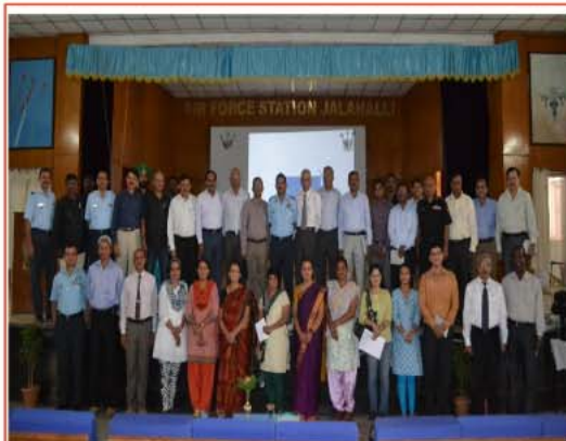
Online Bill Training by UTI-ITSL to OIC Polyclinics