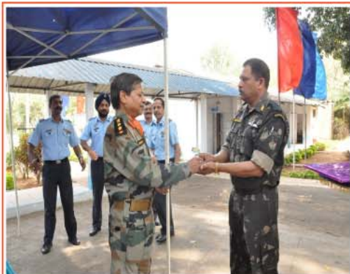
Farewells (Jt Dir Est)