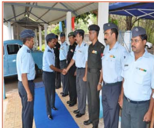
Air Cmde KL Yadav, AOC AFS Jalahalli Visit to RC ECHS Banga- lore : 16 Apr 14