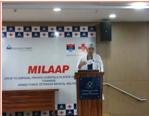
Dr Devi Shetty MILAAP - Drive to Empanel Pvt Hospitals of Karnataka