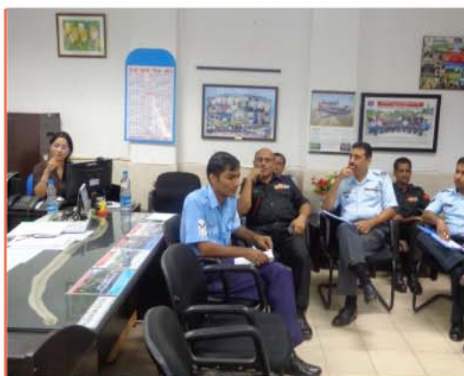
Online Bill Training by UTI-ITSL to RC ECHS Staff