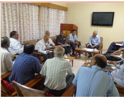
Advisory Committee Meeting Held at Mysore