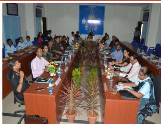
Online bill Processing Conference held at RC ECHS Bangalore by CO ECHS: 12 Jul 2013