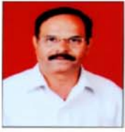
1 ECHS POLYCLINIC BELAGAUM TYPE-B MILITARY STN COL VS KALANGE (RETD)