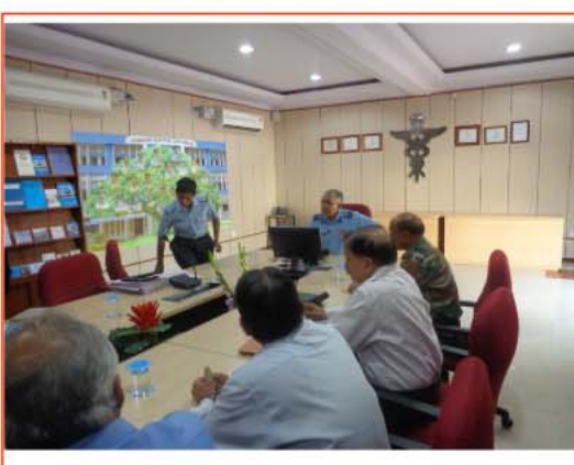
Meeting at CHAF-B held for liquidation of bills. It was chaired by Commandant CHAF-B, attended by Reps of Jt Dir RC BLR and Hospitals