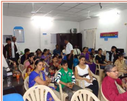
Unit Anniver- sary Celebra- tions